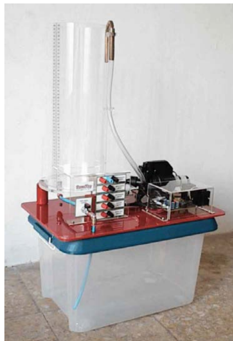
Figure 1-a Diagram of the scale model. 1-b Real tank developed model

The figure 1-b shows a real tank model that implements the characteristics of this proposal.